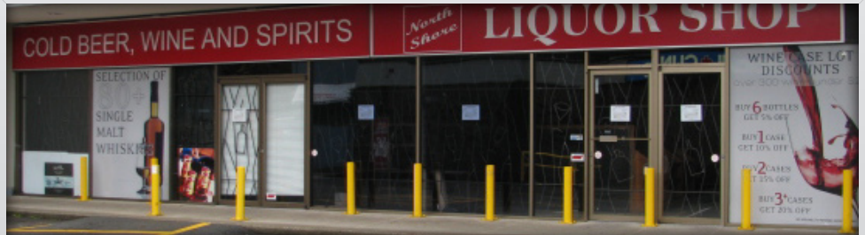
Vacant Unit ... After