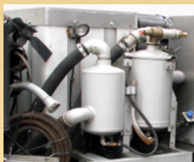
300 gal fresh water tank on board for hydro-flushing and power washdown.