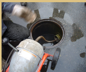
200 ft x 1 1/4" sectional auger with root cutting and drain clearing heads.