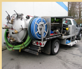
60 ft of 3" vacuum hose and 100 ft of 2" vacuum hose and 600 gallon capacity tank.

To avoid costly flooding of your property or hydro-flushing service to remove blockages from your drain lines, have your catch basins cleaned annually.