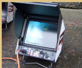
325 ft self leveling drain camera with colour video, audio, and USB reporting.