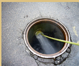
3000 psi / 20 gal per minute hydro-jetter with 450 ft of line for root cutting & flushing.