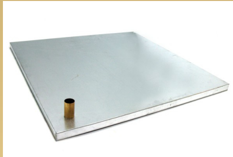
Bottom of Drip Pan