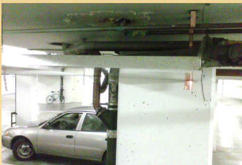
Drip Pan Secured in Place