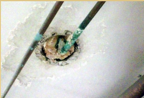
Corrosive Water Ingress