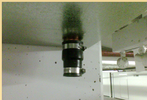
Flexible Drain Mount