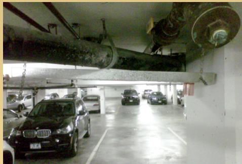
Drip Pan Adjustable Mounts