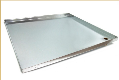
Top of Drip Pan

Our galvanized drip pans come in 3 sizes: 44" x 56", 116" x 20", and 116" x 44", and can be installed in a variety of areas to control water ingress and prevent corrosive water from damaging parked cars. We collect the dripping water and drain it away harmlessly to the floor. Slow leaks will often evaporate in the pan with no need for drainage. All our drip pans have soldered seams with a 1.5" high lip and a 1.5" diameter copper soldered drain spout.