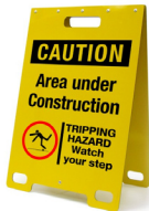
Portable A-Frame Signs