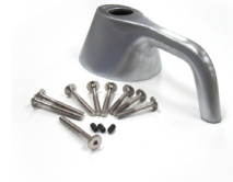
Deadbolt Lock Guards