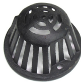
Roof Drain Covers