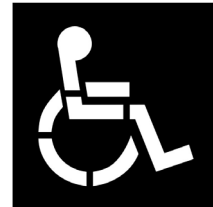
Line Painting Stencils