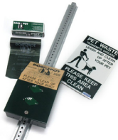
Pet Waste Stations